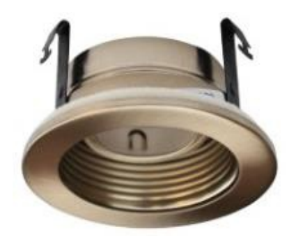
B3001/3 inch Baffle Trim

Lamp: MR16 LED GU5.3 8W Max. GU10 LED GU10 8W Max. PAR16 LED E26 8W Max.