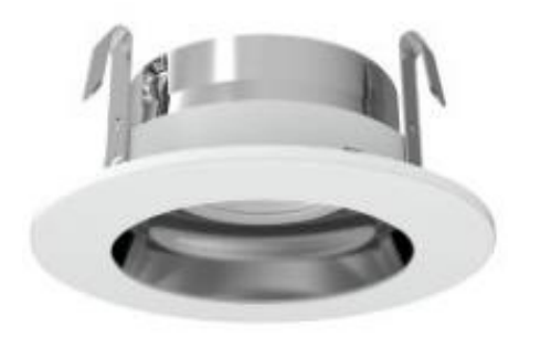
B3002/3 inch Reflector Trim

Lamp: MR16 LED GU5.3 8W Max. GU10 LED GU10 8W Max. PAR16 LED E26 8W Max.