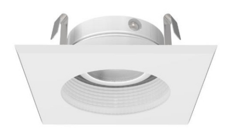
BS3001/3 inch Square Baffle Trim

Lamp: MR16 LED GU5.3 8W Max. GU10 LED GU10 8W Max. PAR16 LED E26 8W Max.