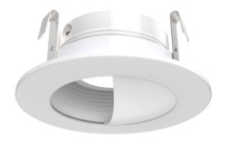
B3006/3 inch Wall Washer Trim

Lamp: MR16 LED GU5.3 8W Max. GU10 LED GU10 8W Max. PAR16 LED E26 8W Max.