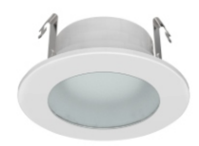
B3802/3 inch Shower with Frosted Lens

Lamp: MR16 LED GU5.3 8W Max. GU10 LED GU10 8W Max. PAR16 LED E26 8W Max.