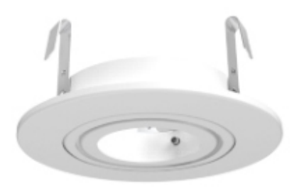
B3007/3 inch Gimbal Ring Trim

Lamp: MR16 LED GU5.3 8W Max. GU10 LED GU10 8W Max. PAR16 LED E26 8W Max.