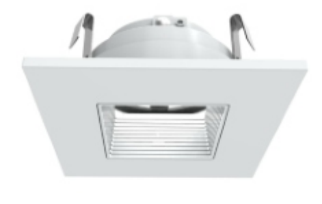
B3011/3 inch Square Trim

Lamp: MR16 LED GU5.3 8W Max. GU10 LED GU10 8W Max. PAR16 LED E26 8W Max.