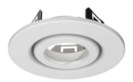
B3008/3 inch Gimbal Trim

Lamp: MR16 LED GU5.3 8W Max. GU10 LED GU10 8W Max. PAR16 LED E26 8W Max.