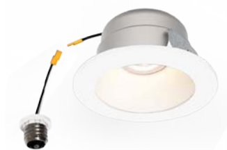
Shown With White Light Engine, Round Reflector And Round Trim