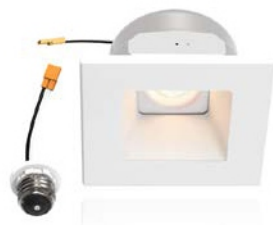
Shown With White Light Engine, Square Reflector And Square Trim